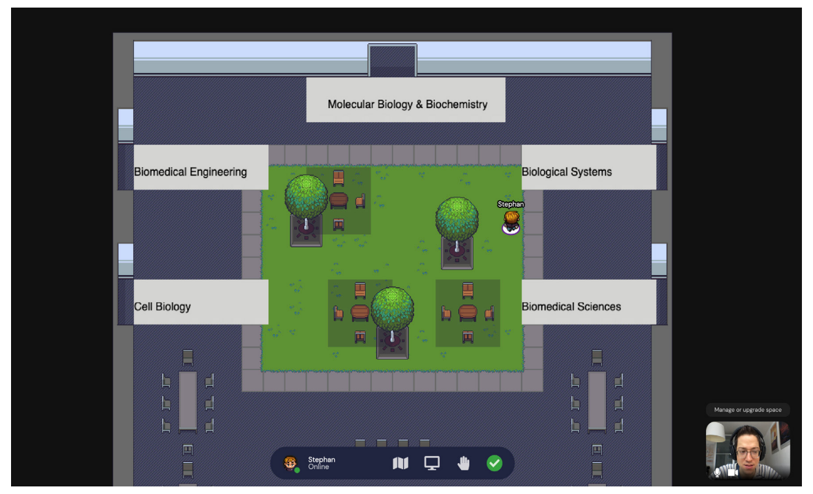
Gather Town Main Hall